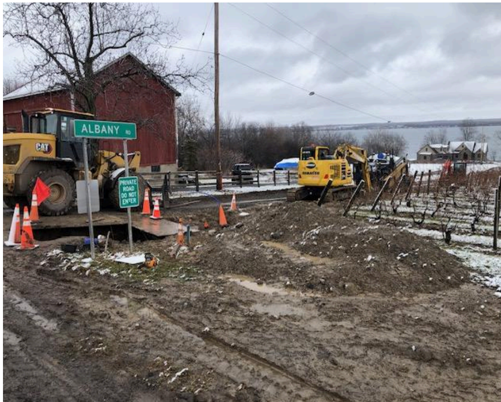
Contractor drilling under Route 14 from East to West at Carlson Road

Next, work continues on Water District One ( WD1 ) with a completion date set sometime in the next few months, if no further unexpected delays occur.