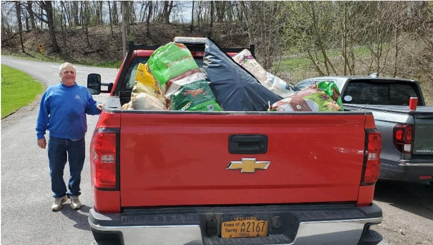
Tim Chambers with a portion of the trash from the Town of Torrey Earth Day Clean-up