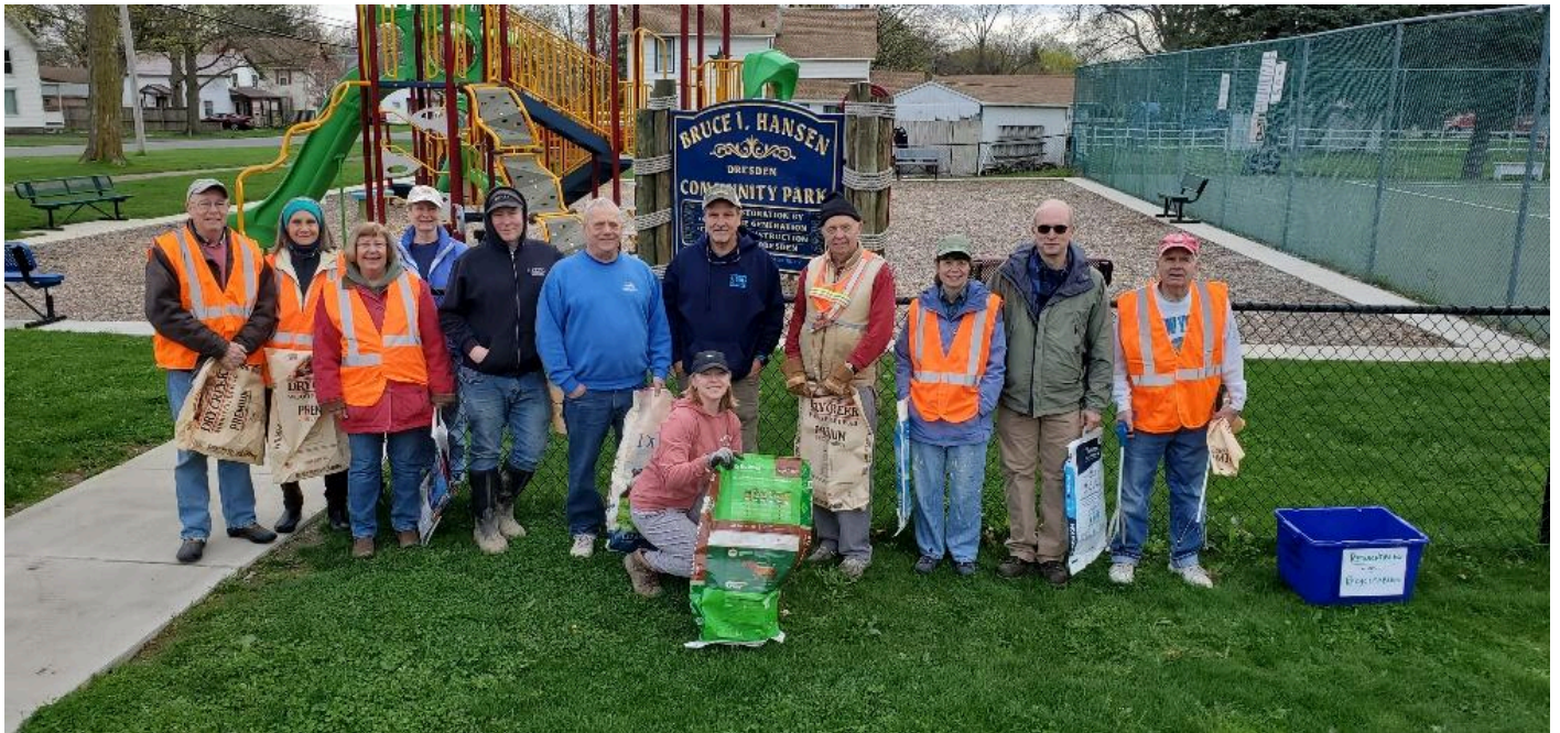
Some of the volunteers who participated in the Torrey EarthDay Cleanup

The Town of Torrey will still hold its annual clean-up for household debris on June 15th. See further details below for acceptable and unacceptable household items at this June 15th event.