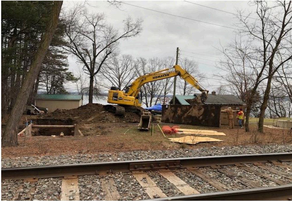
Contractor drilling under Railroad Tracks at North Serenity

In December of 2023, New York State Governor, Kathy Hochul, signed bills to change town elections from odd-numbered years to even-numbered years except for town justices. This means two councilmen seats up for election in November of 2025, will essentially serve three (3) year terms instead of four (4) terms. The two seats up for election in November of 2027 will also serve three (3) year terms. Further, the length of term for Town Supervisor, Town Clerk, and Town Highway Superintendent is changed to four (4) year terms from two (2) year terms. The election for these offices will be in November of 2025 and will be initially for three (3) years to comply with the new state law.